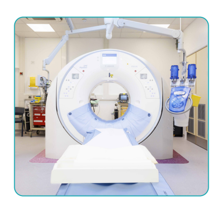
The new scanner located in the ED

The Brainomix AI software, well known for its ability to identify stroke-associated brain damage swiftly and accurately, will empower clinicians to make rapid, reliable decisions critical to the patients' clinical outcomes.